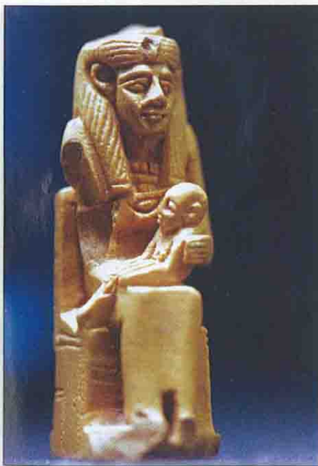
The Egyptian goddess Isis is depicted with her son Horus. Symbol of the reborn sun, Horus was believed to have been born at the winter solstice.

The Mithraic religion provided the foundation for the Christmas celebration. Mithraism became very popular in the Roman Empire, and many elements of its worship survive today.