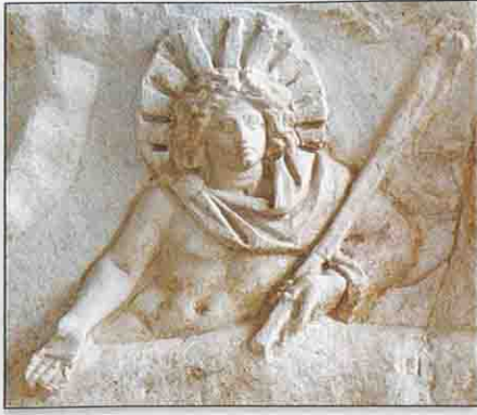
Practices associated with worship of the pagan sun god Mithras, such as celebrating his supposed birth on Dec. 25, survive in today's Christmas customs.

The Mithraic religion provided the foundation for the Christmas celebration. Mithraism became very popular in the Roman Empire, and many elements of its worship survive today.