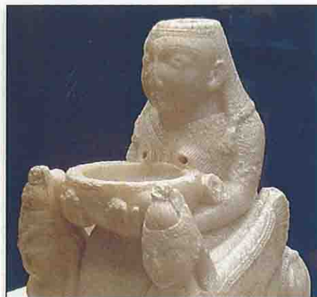
The goddess Astarte, depicted here in a Phoenician statuette, was one of several deities worshipped on Dec. 25 in the ancient world.

"[At that time] Christmas was attacked as